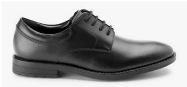
Leather Bar Shoe