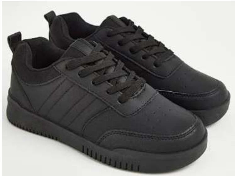
Schuh Black Lace Up