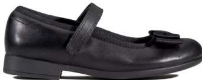
Patent Leather Shoe