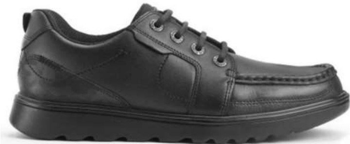
ASDA Black Skater shoe