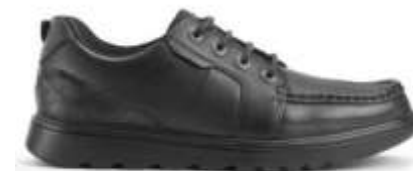
Plain school shoe