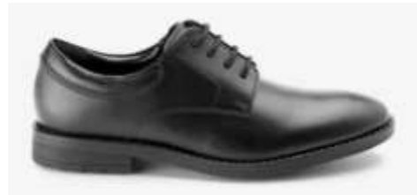
Leather bar shoe