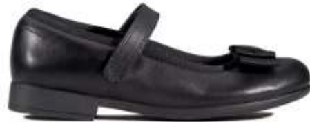
Patent leather shoe