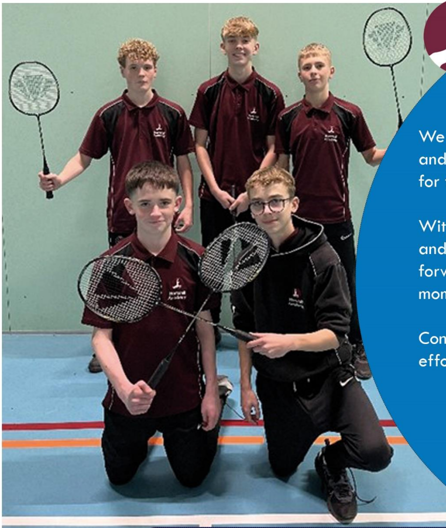
U14 Boys Team