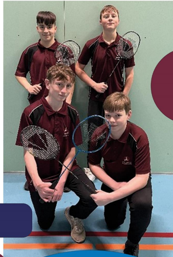
U16 Boys Team

Notably, our doubles teams showcased remarkable coordination, winning the majority of the games. Their hard work in training and ability to adapt during matches have been commendable.